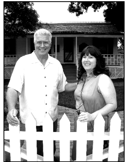
Huell Howser with Cynthia Ward at the 1857 Mother Colony House

California's Gold episode on Anaheim airs locally on KCET on Friday, September 12 at 10:00 PM , and repeats on Sunday, September 14 at 7:00 PM . As a special treat, Linbrook Bowl (featured on the program) is having a no-host party on Sunday to watch the show – and you are invited! Plan to get there by 6:45 so you can find a comfortable seat before the show starts. They have good food and beverages available (please note that they don't take credit cards). Linbrook Bowl is located at 201 S. Brookhurst near Lincoln. See you there!